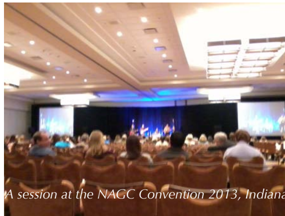
A session at the NAGC Convention 2013, Indiana