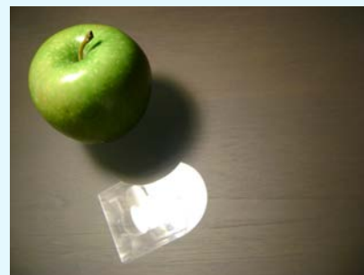
PHOCUS © 2013